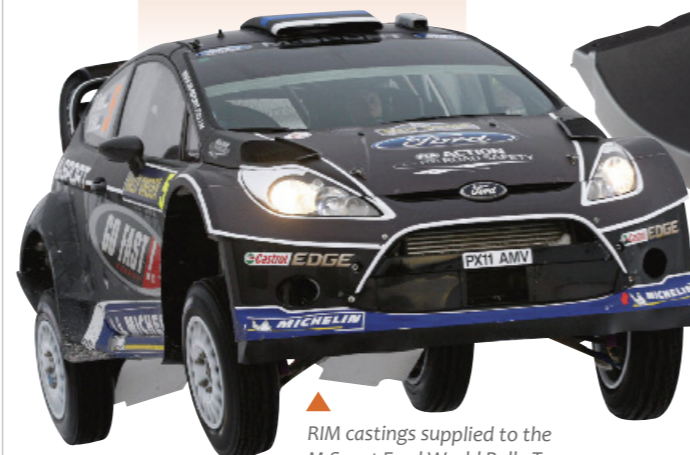
RIM castings supplied to the M-Sport Ford World Rally Team, including sill panels, rear quarter panel protectors and front bib spoilers.