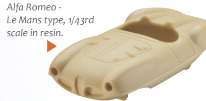
Alfa Romeo - Le Mans type, 1/43rd scale in resin.