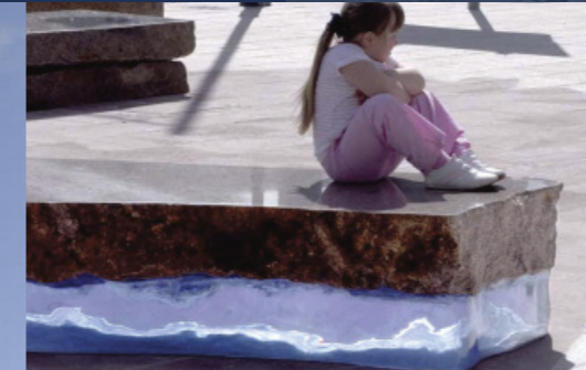
▲ "Coastline" Artist: Simon Hitchins Location: Workington, Cumbria. Town centre project. Local Granite and Crystal Clear™ resin.