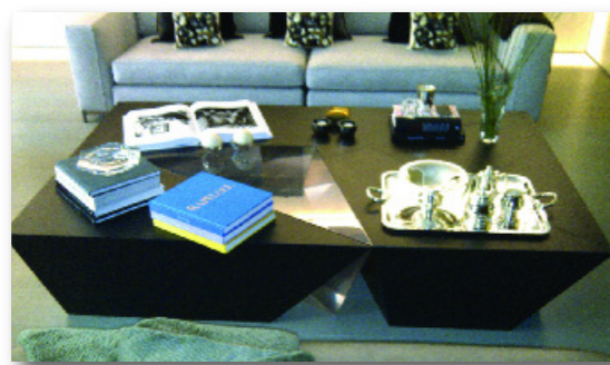
"Coffee Table" by designers 1508 London. 2m table cast in approx 50 kg Crystal Clear™ resin and powder coated steel.