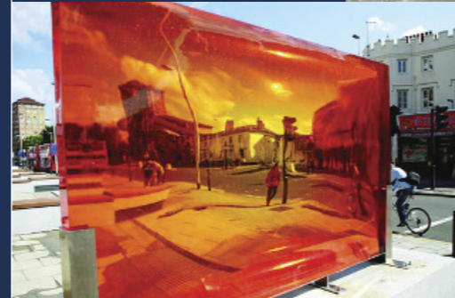
▲ "Massive Orange Object" Artist: Nick Turvey Location: South Bank University, London (Lambeth College of Art). 3m x 2m, 700Kg, Crystal Clear™ resin.