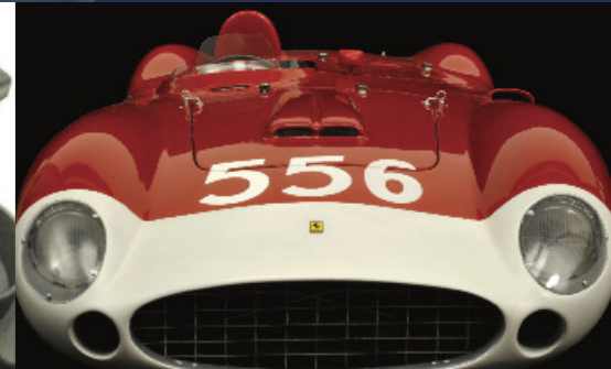
▲ SCALE MODELS