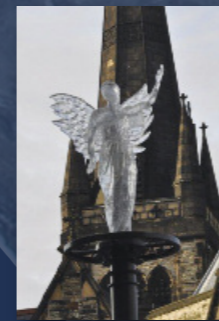
"Angel Fields" Artist: Lucy Glendinning Installed at Hope University, Liverpool. 1830mm tall, 180kg Crystal Clear™ resin.