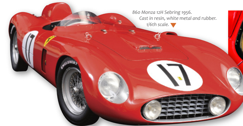
860 Monza 12H Sebring 1956. Cast in resin, white metal and rubber. 1/6th scale.