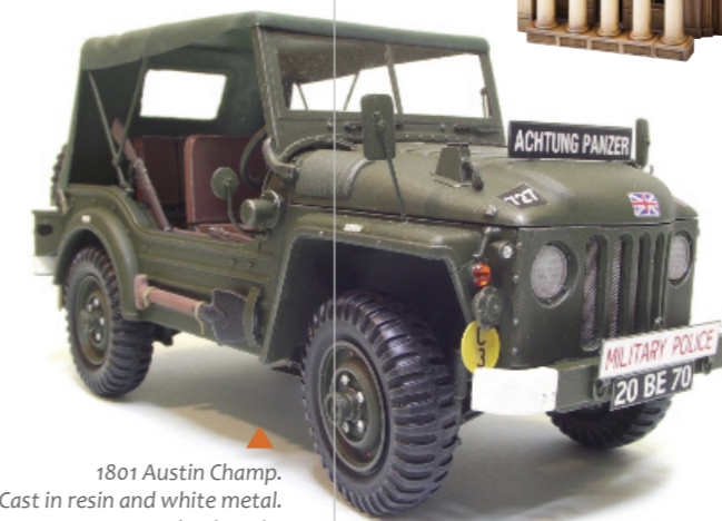
1801 Austin Champ. Cast in resin and white metal. 1/24th scale.