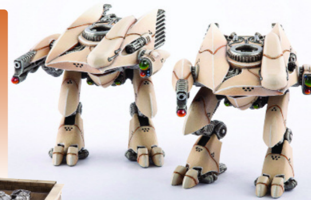
Hawk Wargames models. Cast in resin and metal