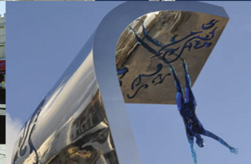
▲ "Wave" Artist: Lucy Glendinning Crystal Clear™ resin 3m tall diver and decorative panels mounted in polished stainless steel. Location: St. John's Square, Blackpool.