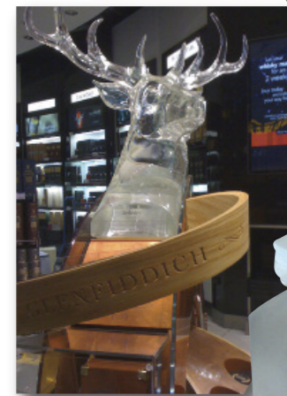
Glenfiddich Gondola Display, Stag's head cast in Crystal Clear™ resin.