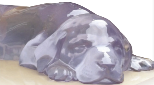
"Sleeping Puppy" installed upon a gold plinth. Crystal Clear™ resin, 2m x 1.2m x 1m high, 750Kg.