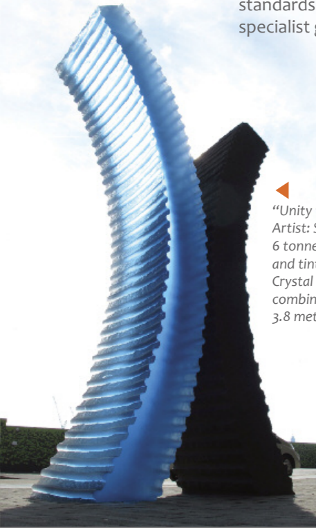
"Unity" Artist: Simon Hitchens 6 tonnes of granite and tinted blue Crystal Clear™ resin combined, nearly 3.8 metres high.