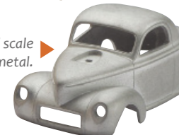
Willys, 1/43rd scale in white metal.